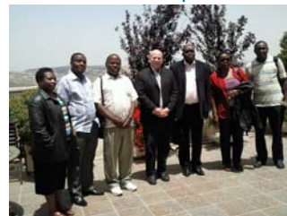
Official Tanzanian Delegation visit to CBS

In addition, "casual visitors" are interested in the activities conducted in the ICBS and in statistical information about Israel.